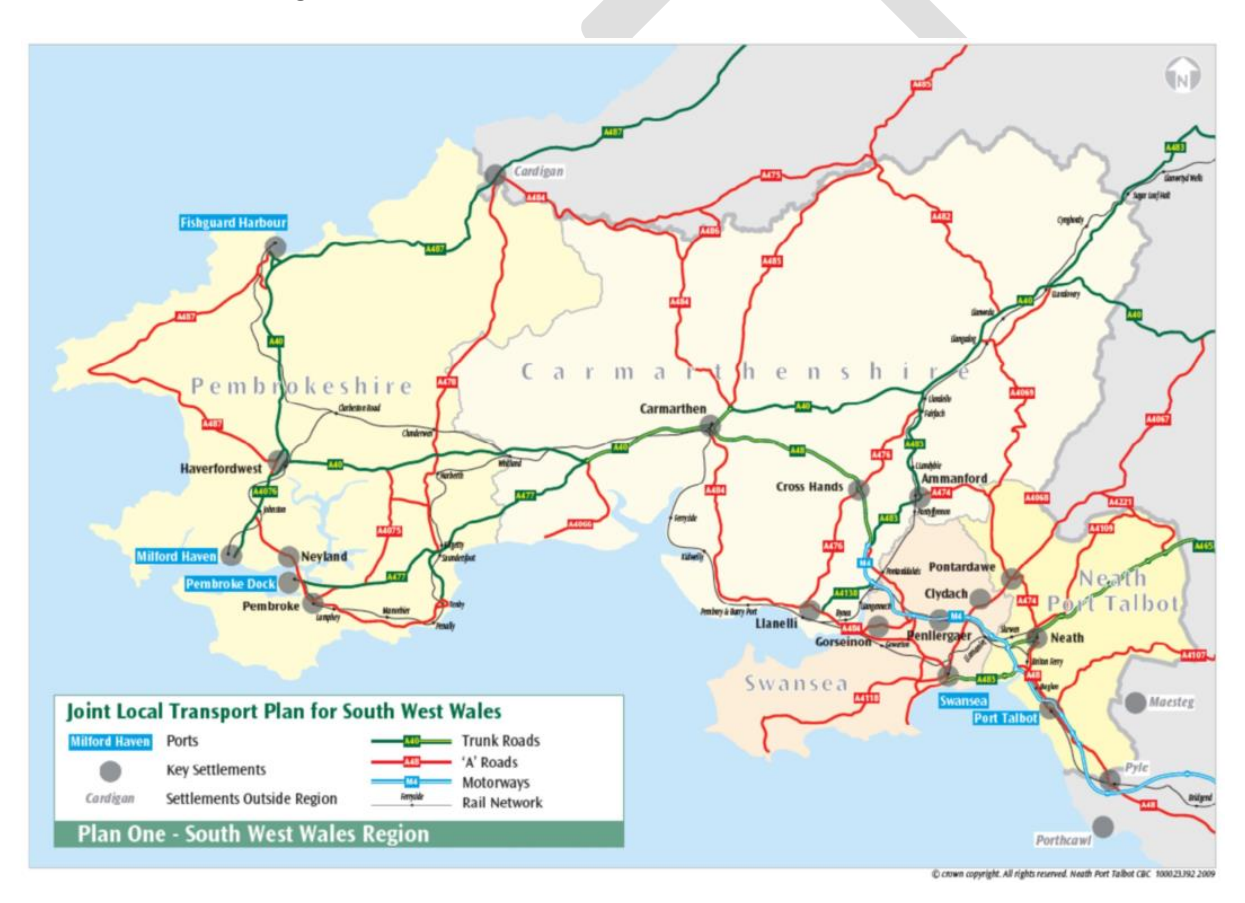
Figure 1 – Area Considered in the South West Wales Regional Transport Plan.